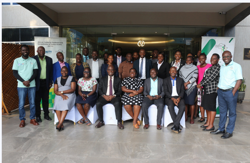
A group photo of ACTV staff and the State Prosecutors from ODPP UGANDA and CID officers from Uganda Police after the training in the greater Masaka