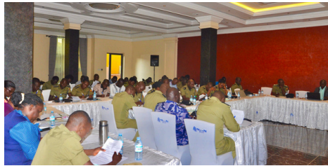
ACTV Q1 2025: Advocacy & Workshop Initiatives in Action