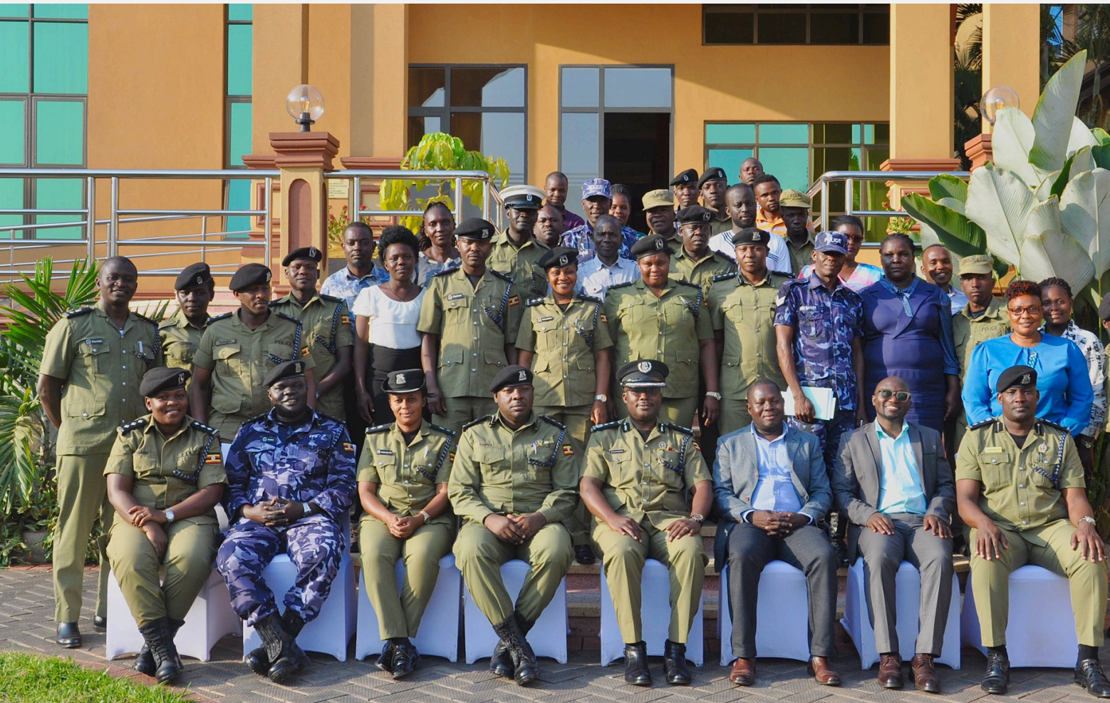
Group photo of Police officers and ACTV staff after the training on torture and human rights at Nican Hotel, in Seguku-Kampala district