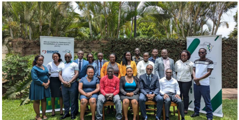
Group photo of CAT members after the two days workshop on advocacy initiatives on torture free election and the ratification of OPCAT

March 24 th -25 th , 2025; Two days workshop for the Coalition Against Torture (CAT) on advocacy initiatives for torture free elections and the ratification of Optional Protocol to the Convention Against Torture