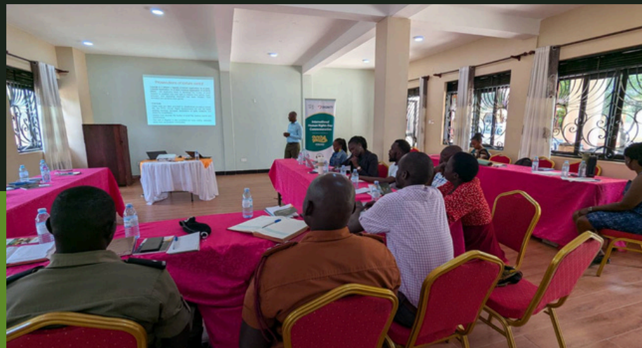
ACTV staff during the dissemination process of the study in Kaabong district

On March 25th, our efforts extended to the Kaabong district for the dissemination of the research report on "A study on the barriers to effective implementation of the Prevention and Prohibition of Torture Act, CAP 130."