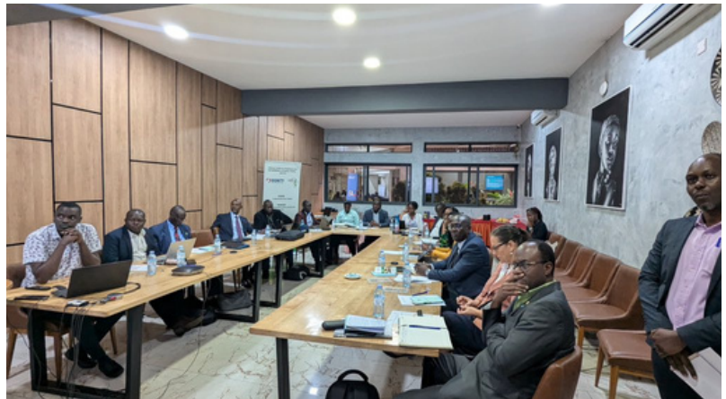
A high level co-organised workshop with UHRC on Prison health in Uganda with the aim of delving deep on how best the health of inmates all over the country can be improved.

On 27 th March, 2025 A high level co-organised workshop with UHRC on Prison health in Uganda with the aim of delving deep on how best the health of inmates all over the country can be improved.