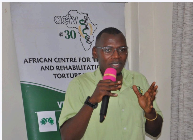
ACTV Research and Documentation officer presenting during the research training

By strengthening our understanding of research methodologies, we are better positioned to document best practices and improve our services. We believe that a stronger team, creates stronger services