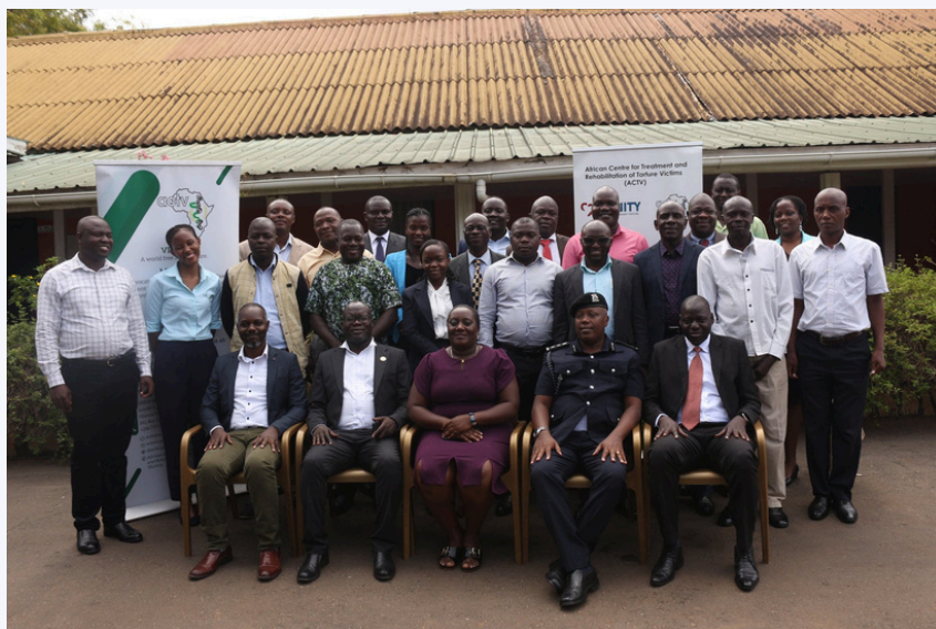
A group photo of ACTV staff and the State Prosecutors from ODPPUGANDA and CID officers from Uganda Police after the training in Moroto District in Karamoja Region