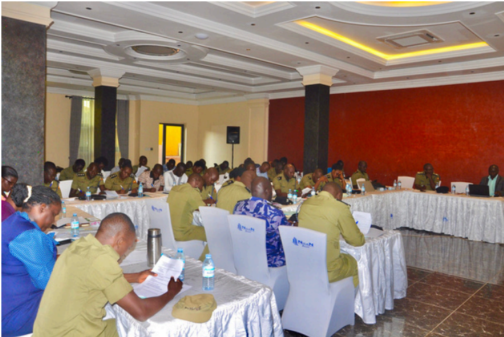
Photos of Uganda police officers during the training session