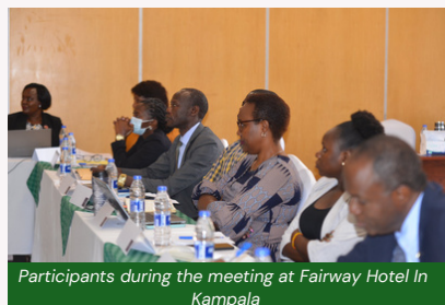
Participants during the meeting at Fairway Hotel In Kampala