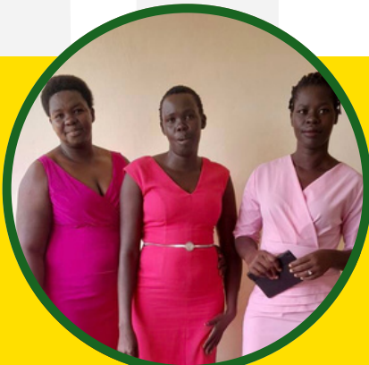
ACTV ladies from the Gulu office posing for a photo in celebration of international women's day