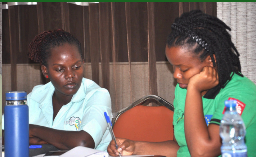
ACTV team during their search training facilitated by ACTV Research and Documentation officer at Arch Apartment in Kampala

On February 26 th and 27 th , we invested in our most valuable asset – our staff! We held a two-day training at Arch Apartment Hotel, focusing on equipping our team with essential research skills. This initiative, organized by our dedicated M&E department, aims at integrating research practices into our daily work, enhancing the quality of care and rehabilitation we provide to survivors of torture.