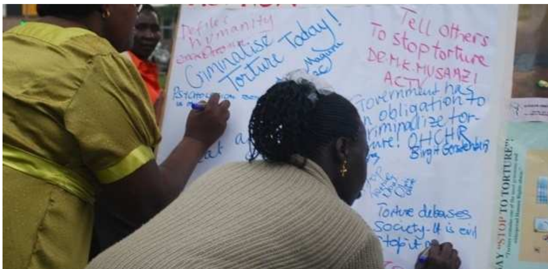
Figure 1.5: Ugandan police discussing issues of torture (file photo)