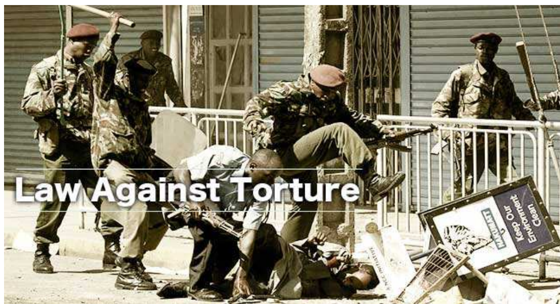
Figure 1.2: Police action in Kenya (file photo)