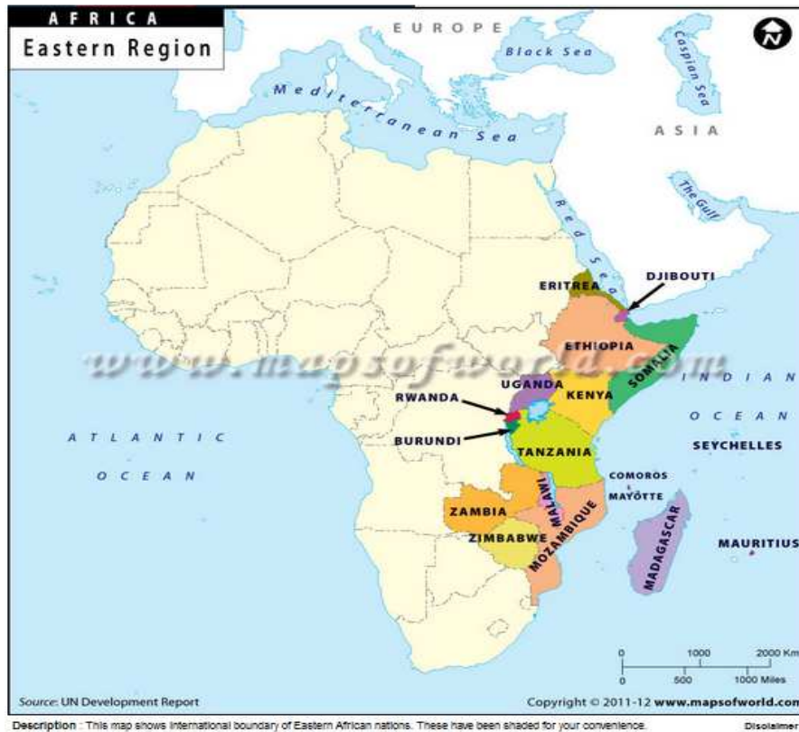
Figure 1.1: The international boundaries of eastern African nations